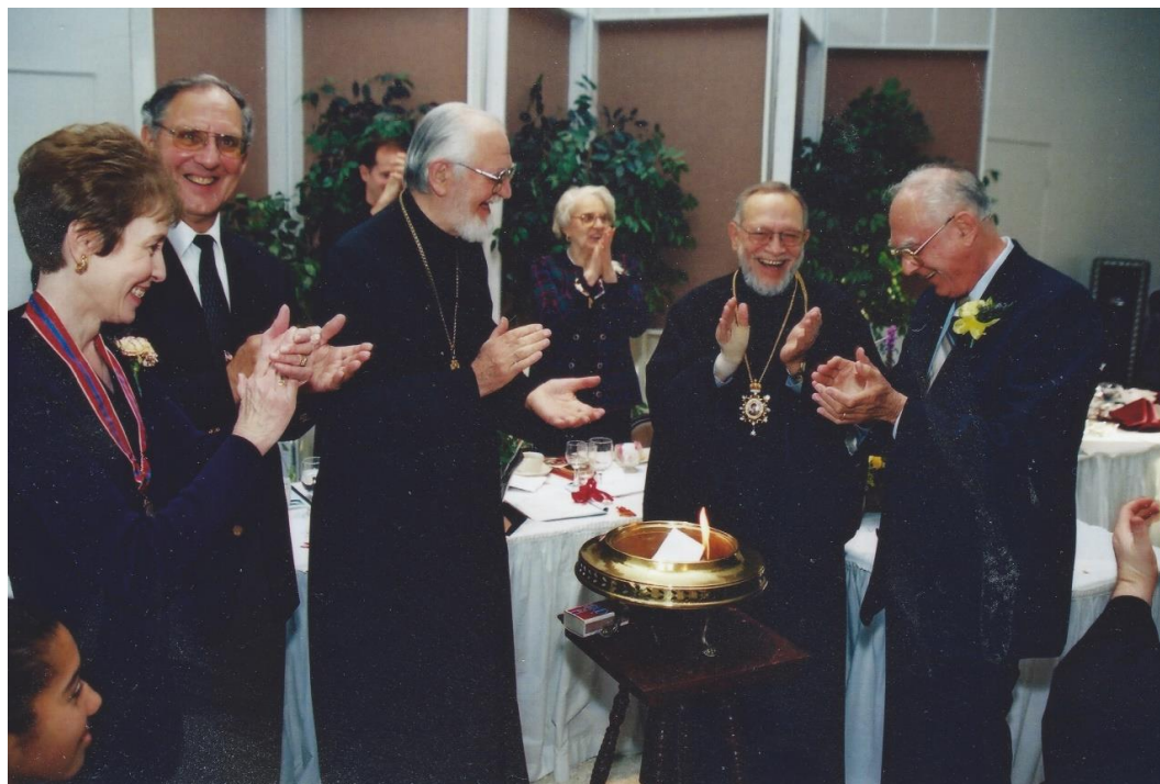
St. Luke Mortgage Burning Sunday, November 11, 2001